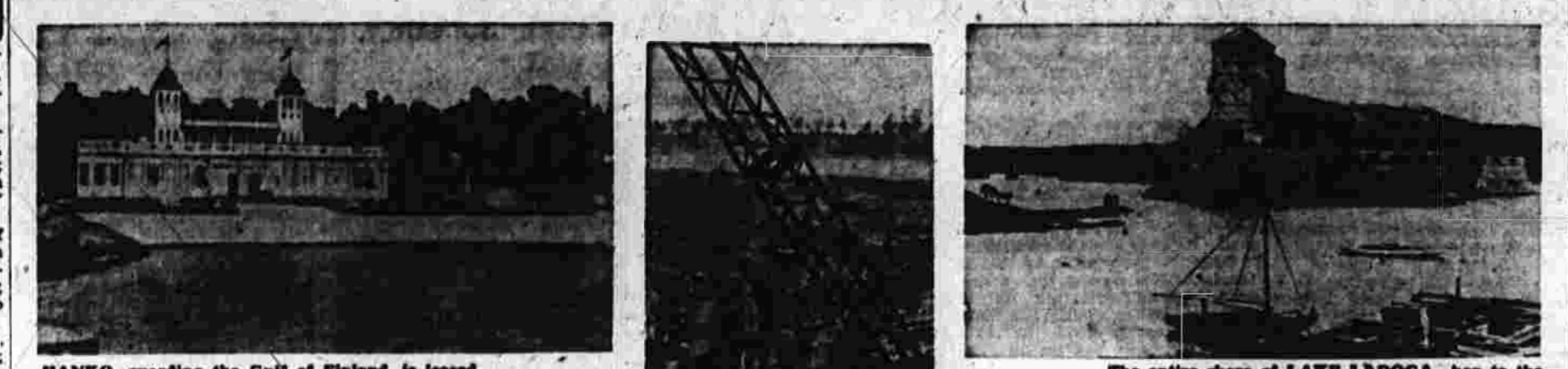
HANKO, guarding the Gulf of Finland, is leased to a naval base to the Soviets for 30 years.

Finland cedes to Russia the strategically vital Karelian Isthmus, including VIPSUHI (above).