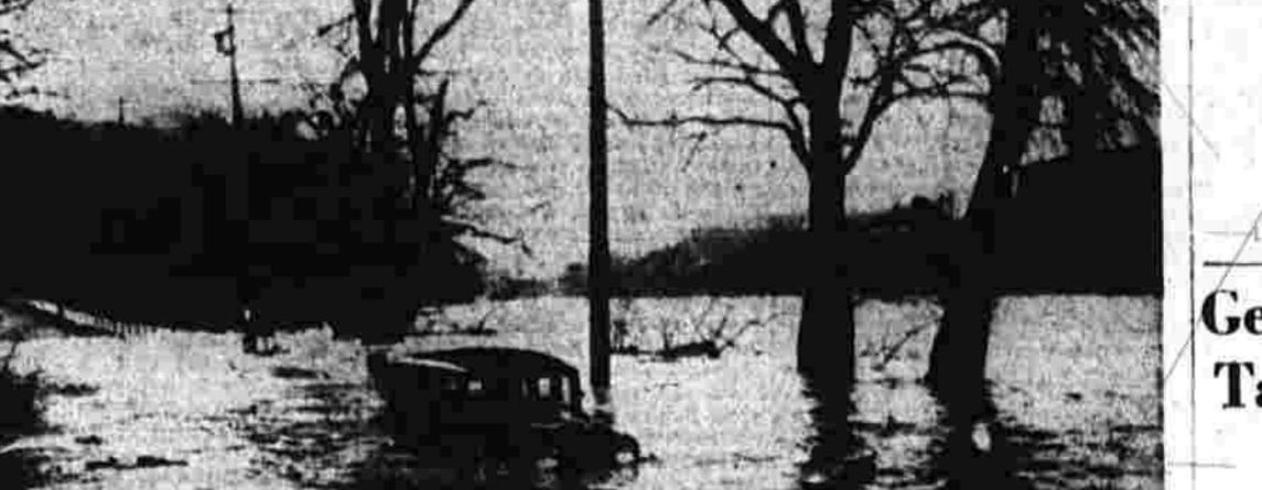
The Schuylkill river, rising nearly a foot an hour overnight, brought this flood scene to East River drive in Philadelphia, while other eastern Pennsylvania streams, swollen by rains, flooded other lowlands and highways.