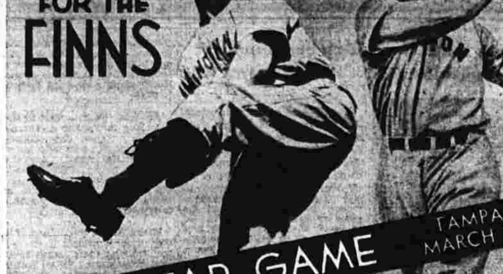
ALL STAR GAME MARCH 17

At least, the Nationals will have to look to Red Ruffing and probably Bob Grove. But that is slight comfort with men like Bob Feller, Jimmie Foxx, Leonard, Tom Bridges and Vernon Gagne ready to fire at them. Following are the starting lineups, giving the batting averages and fielding percentages.