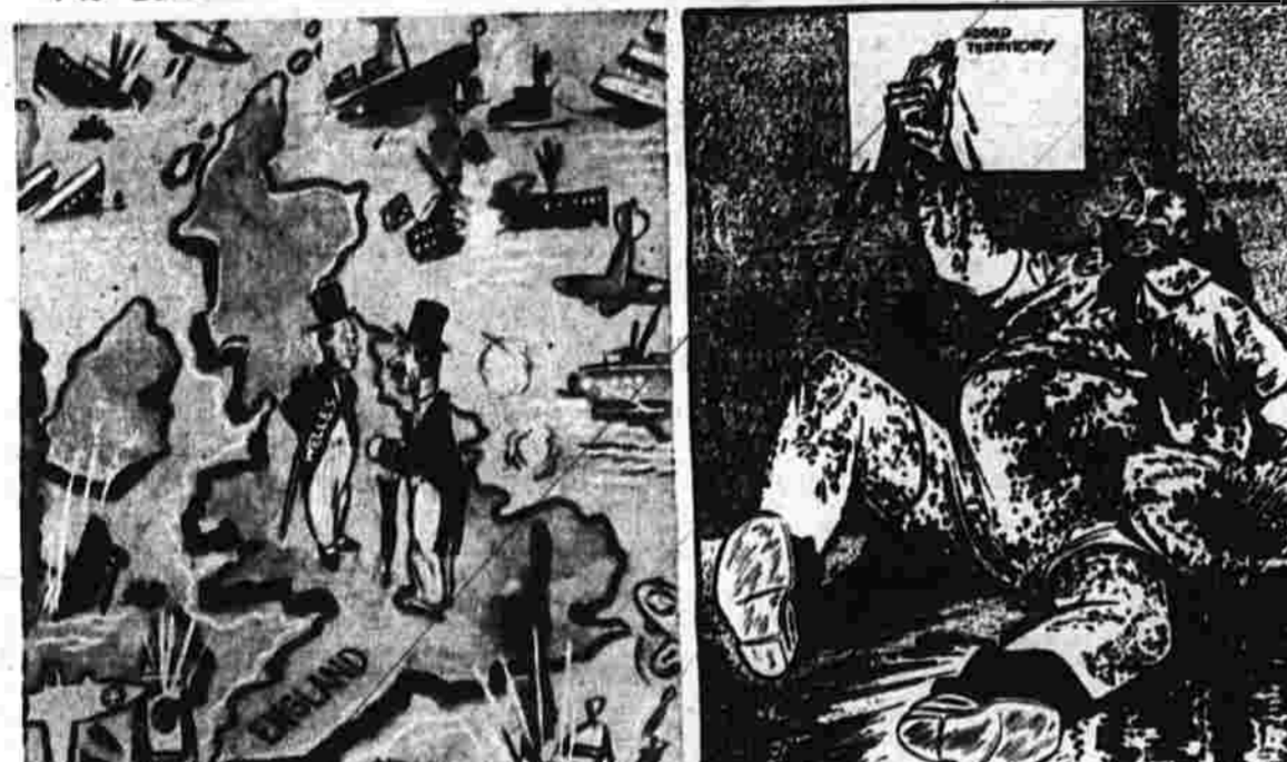
'And Last Night We Dropped Leaflets On Berlin' 'He Stuck In His Thumbs And Pulled Out A Plum'

As Cartoonists Picture War In The West And Peace In The North