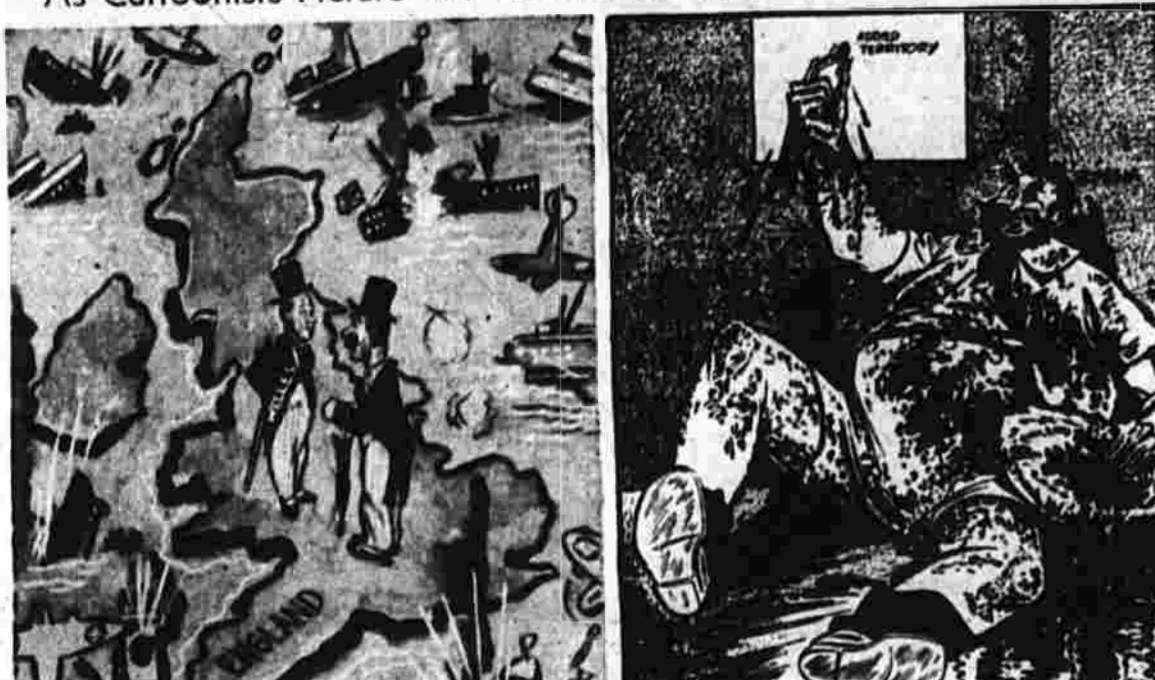
Left: In President's Office. Right: 'And Last Night We Dropped Leaflets On Berlin' 'He Stuck In His Thumb And Pulled Out A Plum'

When the House whacked $400,000,000 from the President's budget of $789,000,000 for farm-ers, later on, cynics concluded genuine amputation was being performed.